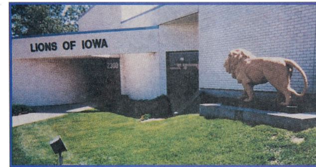
Lions of Iowa State Office Building 2300 South Duff Avenue Ames, Iowa 50010

Building for the future... Creating a memorial of the past.